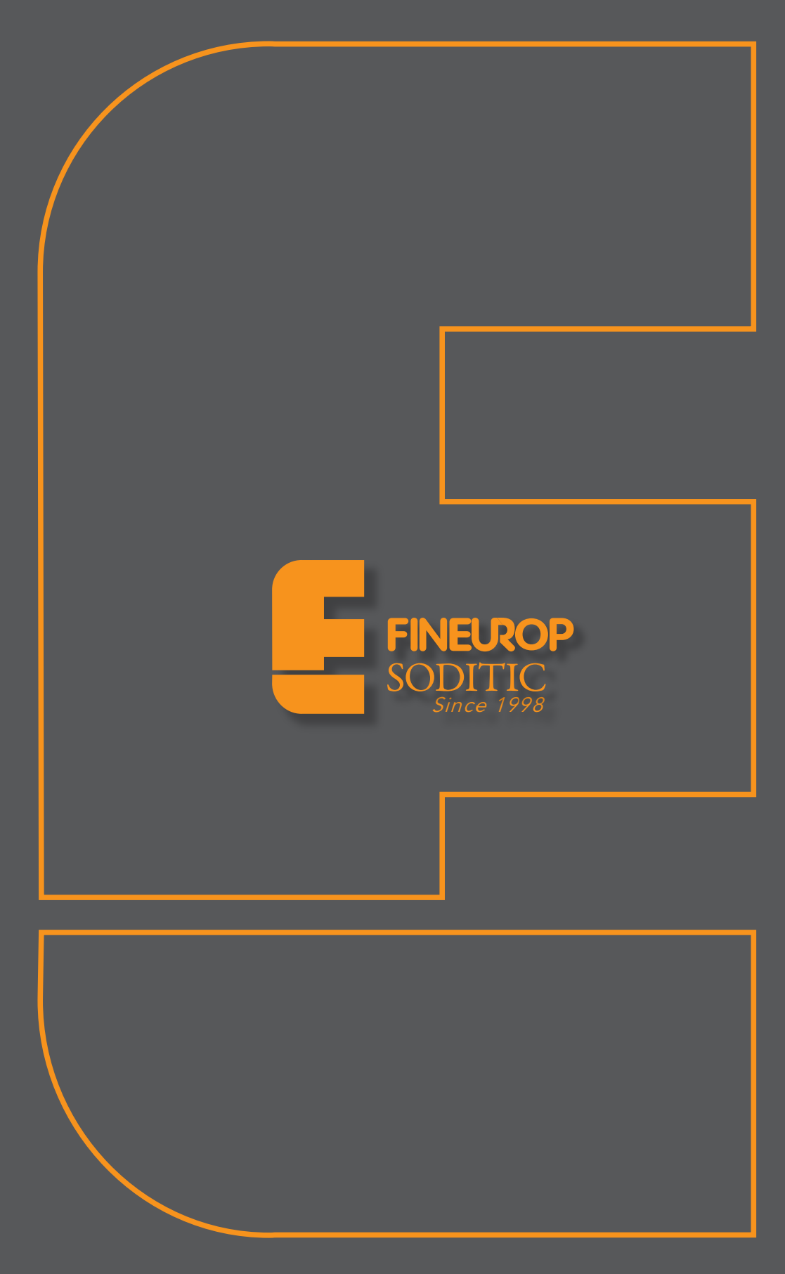
YOUR ADVISOR IN CORPORATE FINANCE